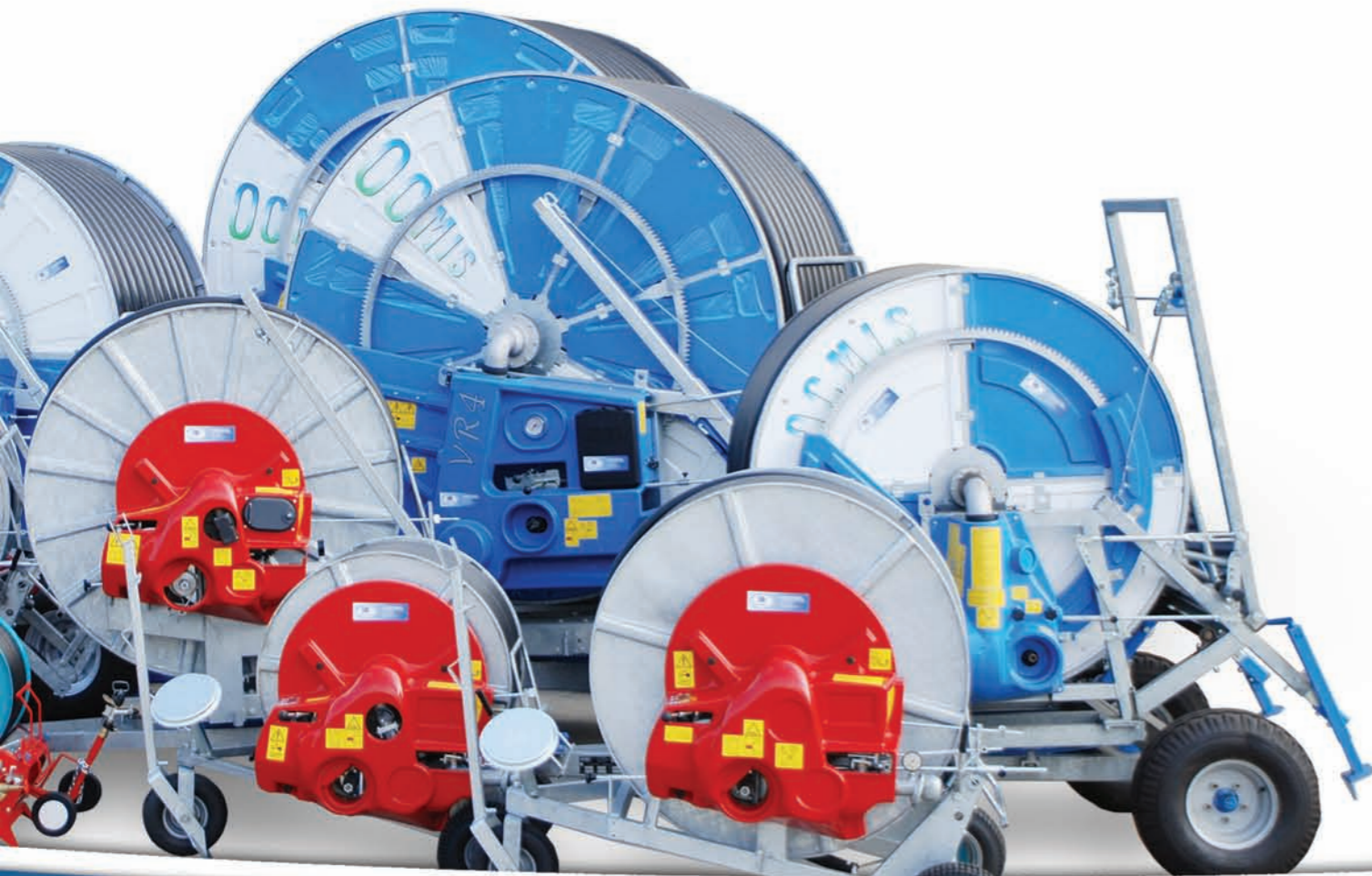
OCMIS Variorain, R Series and Microrain Series shown

From INTAKE to EXPLUSION... The SOLUTIONS are here